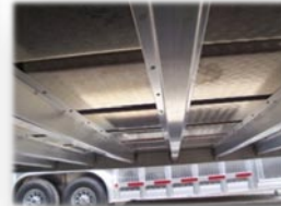
3-1/2" Tubular cross-members on 15" centers