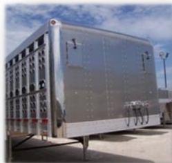
Radius Front shown with optional Stainless Steel Front Corners, Nose Vents