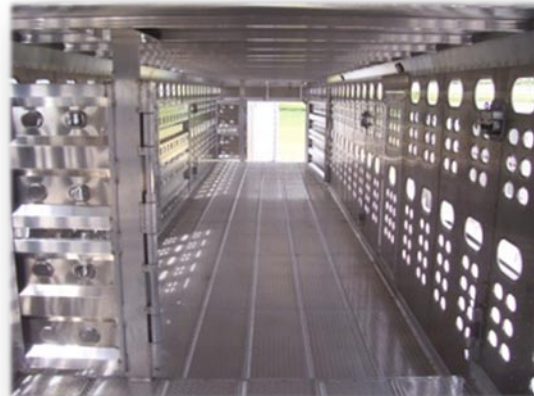
Open Floor Plan with 2/3 dividers at drops to assist with loading while providing a safe zone for operator