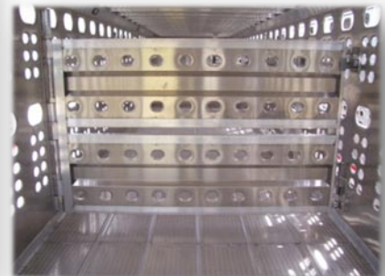
Heavy Duty Divide Gates