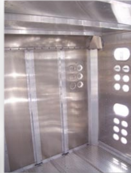
Extruded Front Radius Corners Provide Strength and Maximum inside clearance