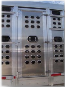
Full Height Side Door