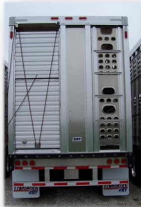
Vented back end with hinged wash out