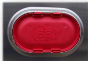
Plastic Closure Plugs