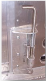
Stainless Spring loaded latches