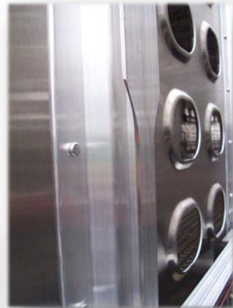
Closure Track posts – with tapered notching for easier closure installation