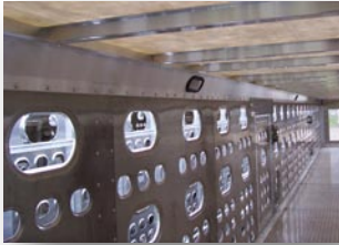
Clean internal roof rail—no exposed wiring