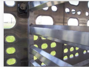
Hex-Tube Divide Gates