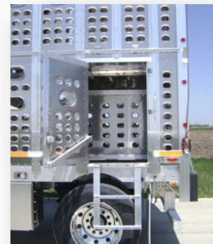
Driver Side Escape Door