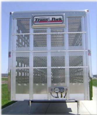
Fully vented front end with lighted sign