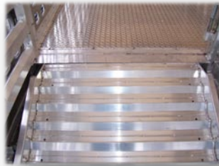
No Step Pull Out Ramp