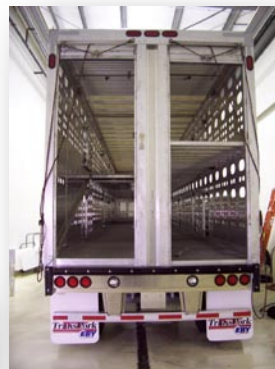
Double Roll Up Doors